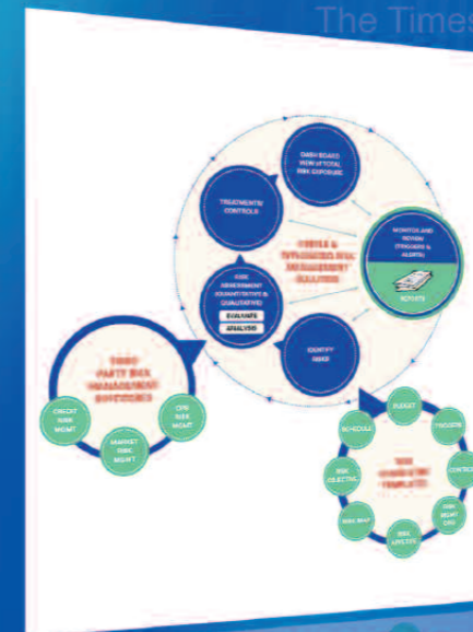
Risk Management Solutions

"American Express to Pay $65M Money-Laundering Fines"